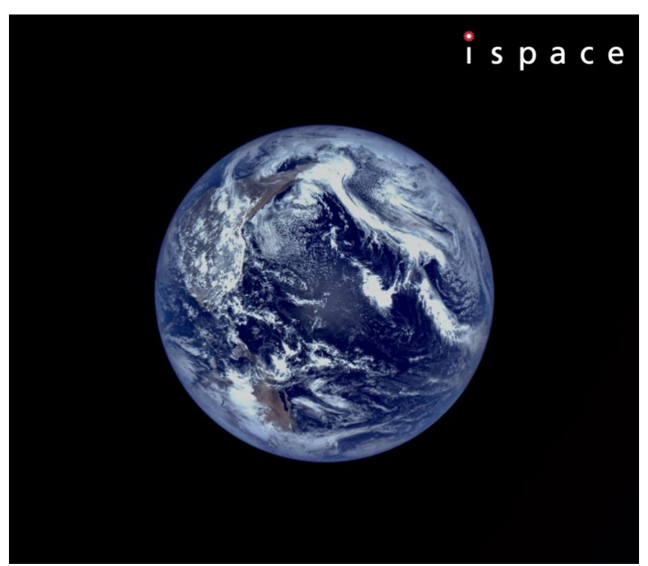
An image of the Earth taken by the RESILIENCE lunar lander on Feb. 18, 2025.

Significantly, all of the payloads on board the lander have been confirmed as functioning without any abnormalities.