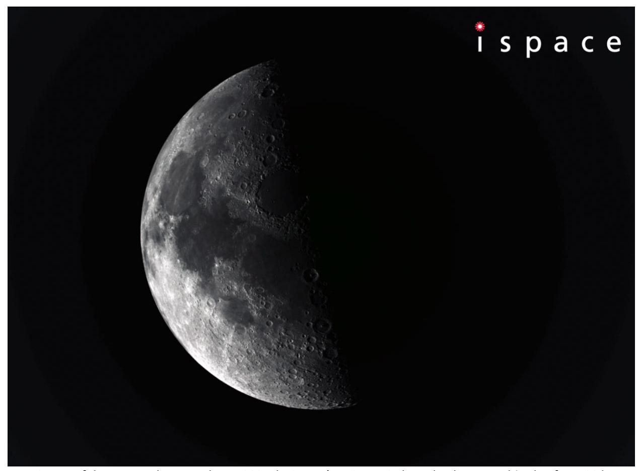
An image of the Moon taken on Feb. 15, 2025, by ispace's RESILIENCE lunar lander at an altitude of 14,439 km.

RESILIENCE is now on a trajectory out to deep space before completing orbital maneuvers that will bring it back towards the Moon in advance of lunar orbit insertion. The date and time of the insertion maneuver have yet to be determined but are expected around early May.