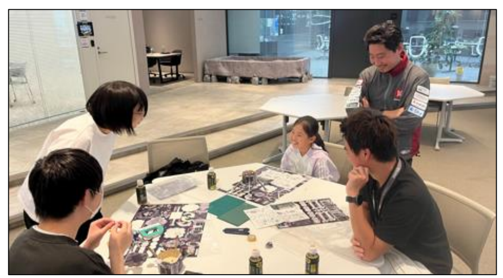
Photo from August 2024 of exclusive shareholder event attended by ispace CEO Takashi Hakamada (pictured right)

Shareholders who own 1,000 shares or more will receive a special commemorative photograph expected to be taken in space by cameras on the RESILIENCE lunar lander after deployment from the launch vehicle or TENACIOUS lunar micro rover on the lunar surface. Delivery of the photo is dependent upon circumstances of the mission, but if successful photographs will be mailed upon the completion of Mission 2.