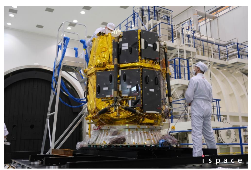
ispace engineers preparing the RESILIENCE lunar lander for testing at a JAXA facility in Tsukuba, Japan.

TOKYO – June 27, 2024 – ispace, inc. (ispace)(<u>TOKYO: 9348</u>), a global lunar exploration company, announced today that the flight model of its HAKUTO-R Mission 2 RESILIENCE lunar lander has successfully completed thermal vacuum testing and remains on schedule for a Winter 2024 launch.