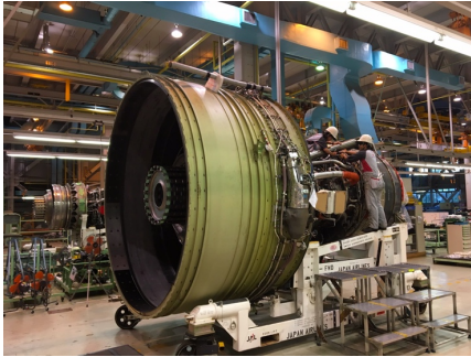
JALEC Engine Maintenance Center