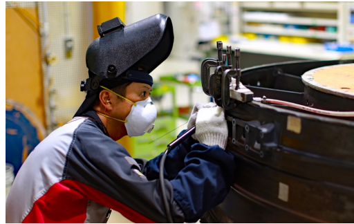
JALEC Engineer Welding JAL Aircraft Engine

About JAL Engineering Co., Ltd. http://www.jalec.co.jp/index.html